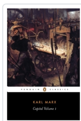
Capital : Volume I Marx, Karl