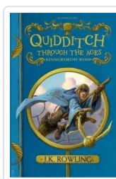
Quidditch Through the Ages Rowling, J.K.