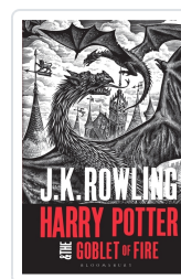
H P 4: the Goblet of Fire Rowling, J.K.