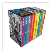
Harry Potter Boxed Set Ed. Adults Rowling, J.K.