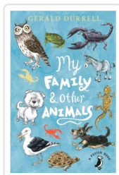
My family and other Animals Durrell, Gerald