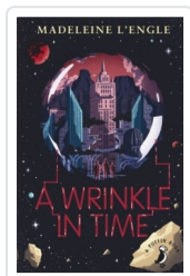
A Wrinkle in Time L'Engle, Madeleine