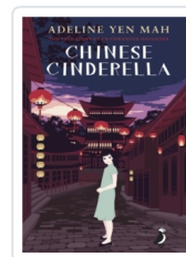
Chinese Cinderella Yen Mah, Adeline