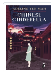
Chinese Cinderella Yen Mah, Adeline