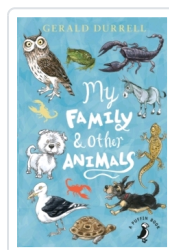
My family and other Animals Durrell, Gerald