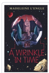
A Wrinkle in Time L'Engle, Madeleine