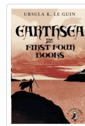
Earthsea: The First Four Books Le Guin, Ursula K.